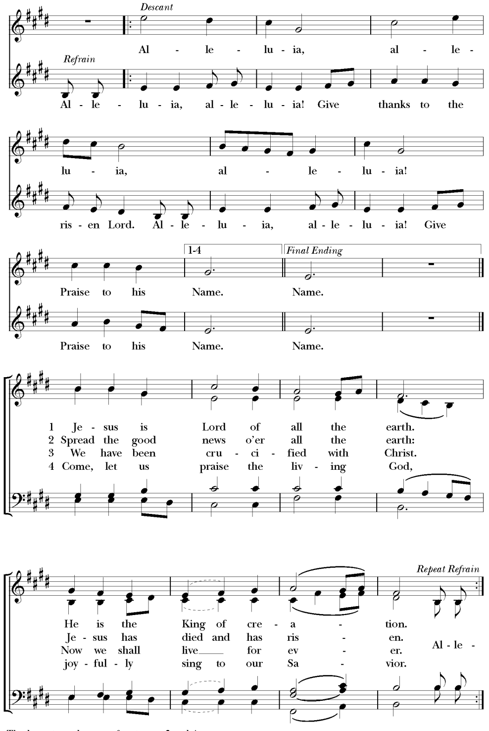
The descant may be sung after stanzas 3 and 4.

Words: Donald Fishel (b. 1950) Music: Allehuia No.1, Donald Fishel (b. 1950) Words, Music (melody): Copyright ©1973, The Word of God. arr. Betty Pulkingham (b. 1928), Charles Mallory (b. 1950) and George Mims (b. 1938) Copyright ©1979, Celebration. All rights reserved. Used with permission.