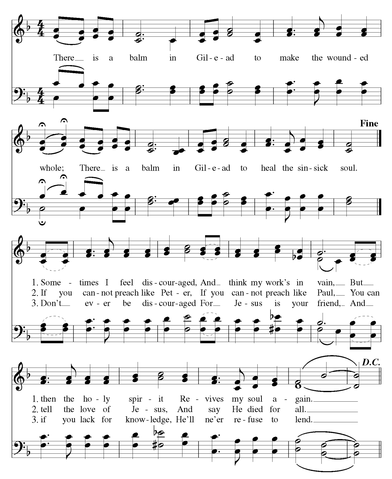
There is a Balm in Gilead